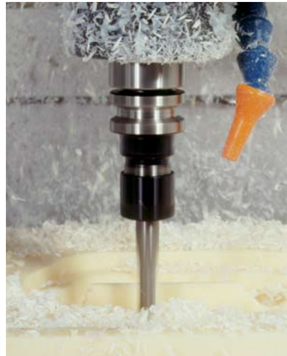
First Cut Prototype provides designers with fast, affordable, functional parts for verification testing.

Do your prototypes need the heat resistance, solvent resistance, and flame resistance of General Electric's Ultem® 1000 resin? The bad news is that Ultem is one of the few resins in which Protomold cannot provide injection molded parts. The good news is that Protomold's FCP division can machine Ultem 1000 parts directly from your 3D CAD model. That means you can have high-quality Ultem 1000 parts suitable for functional testing shipped to you in as fast as one business day, and at a fraction of the cost of traditional injection molding.